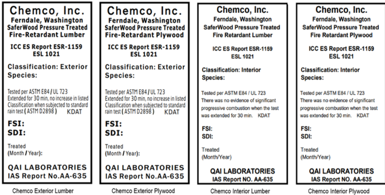
FIGURE 1—TYPICAL LABELS FOR SAFERWOOD-FX, THERMEX-FR AND FRX FIRE-RETARDANT LUMBER AND PLYWOOD